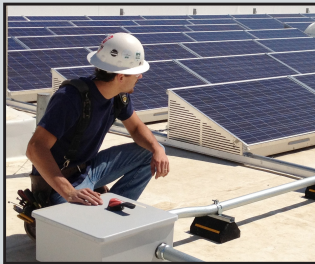
Learn On the Job