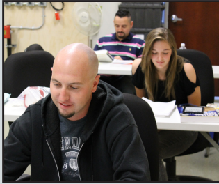
Learn in the Classroom

Their working environment varies, depending on the type of job. Some may work in dusty, dirty, hot, or wet conditions, or in confined areas, ditches, or other uncomfortable places. Electricians risk injury from electrical shock, falls, and cuts; to avoid injuries, they must follow strict safety procedures.