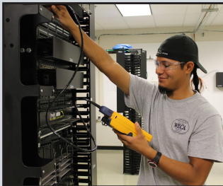
Learn In the Lab