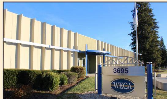
WECA Northern California Training Facility

WECA also has apprenticeship training facilities in Riverside and San Diego, CA.